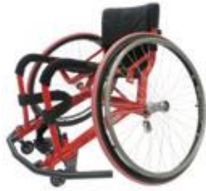
Figure 2. Basketball wheelchair