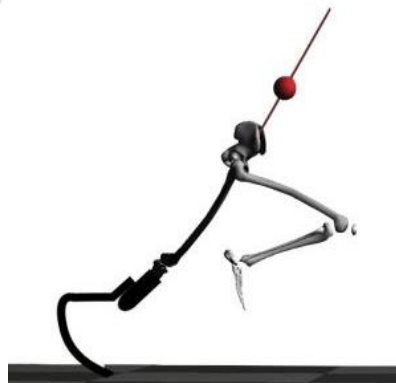
Figure 5. Systematic cooperation and interactive movement between human muscle and spring

Carbon fibers are light and strong and weigh approximately a quarter of iron while exhibiting 10 times higher strength. Three major Japanese manufacturers, including Toray Industries, Inc., account for approximately 65% of the world market. Japan has been actively developing prosthetic legs for racing in the Paralympics to show its manufacturing prowess to the world. Mizuno Corporation and Imasen Engineering Corporation have been jointly developing a prosthetic leg for international use at a total cost of 40 million yen. In cooperation with Atsushi Yamamoto, who won the silver medal in the men's long jump at the 2008 Beijing Paralympics, this prosthetic leg has been repeatedly tested and improved. The prosthetic leg (the main body with a plate spring) is expected to be sold for approximately 250,000 yen. It is hoped that people with prosthetic legs feel that they can run and realize their dreams (Fig.5: systematic cooperation and interactive movement between human muscle and spring).