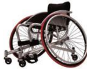
Figure 3. Tennis wheelchair